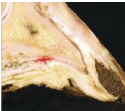
Fig 2. - There can be rather large areas of separation filled with dirt/debris despite maintaining a healthy appearance of the outer hoof wall.

Cases of WLD are often first noticed by farriers during routine trimming/shoeing visits. An area of separation in the hoof wall that is filled with dirt/debris is noted (Fig. 1). When removing the dirt/debris with a hoof knife or curette, an area of undermined hoof of varying degree is revealed. After the dirt/debris is removed, portions of white/grey powder like hoof wall are typically seen before reaching a healthy margin. There can be rather large areas of separation filled with dirt/debris despite maintaining a healthy appearance of the outer hoof wall (Fig. 2). Lameness is usually only noted when extensive separation has occurred, resulting in an instability of the distal phalanx within the hoof capsule (Fig 3).