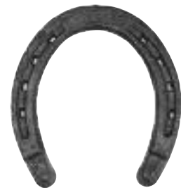
ST. CROIX LITE HEELED