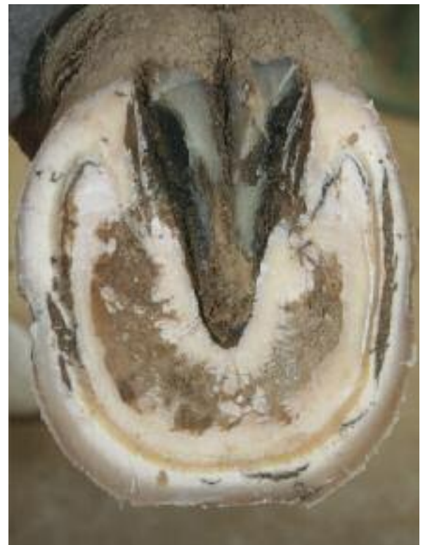
Fig. 1 - Cases of WLD are often first noticed by farriers during routine trimming/shoeing visits. An area of separation in the hoof wall that is filled with dirt/debris is noted.

The cause of WLD has long been debated. Although several theories have been described, none have been proven. The current theory of WLD etiology as described by O’Grady, Moyer and others is that opportunistic, keratinopathogenic microorganisms invade the non-pigmented stratum medium of the hoof wall following an initial separation caused by a mechanical stress or weakness, trauma, abnormal or excessive moisture exposure, or some combination. 1,2 These organisms degrade the keratin in the hoof wall exacerbating the separation. Furthermore, dirt and debris typically fill the separation, acting as a mechanical wedge forcing the wall apart.