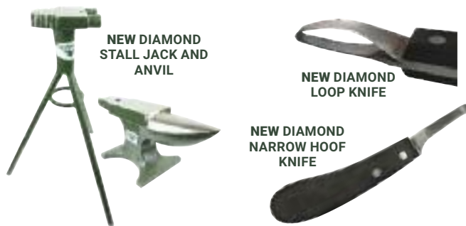
NEW DIAMOND STALL JACK AND ANVIL

Recently, Kerckhaert introduced the new Diamond Tracker horseshoe (right). This shoe features a beveled toe and solid heel area and has been produced in a generic pattern. The steeper bevel in the toe provides good breakover with less chance of slipping and solid heels provide additional support in soft terrain. Compared to the very round shape of the St. Croix Eventer, the Tracker has a more natural shape in the toe and even more so in the branches. Easily shaped into front or hind patterns, the Tracker reduces the number of shoes a farrier needs to carry on their truck and requires less time and effort in shaping for the best fit. The Tracker is quickly making converts out of many Eventer users thanks to Kerckhaert's innovative design and attention to detail.