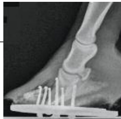
Fig. 3. - Lameness is usually only noted when extensive separation has occurred, resulting in an instability of the distal phalanx within the hoof capsule