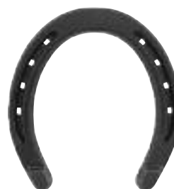
NEW DIAMOND CLASSIC HEELED